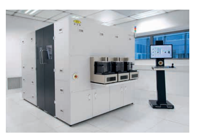
EVG* HERCULES* NIL Automated SmartNIL* UV Nanoimprint Lithography System up to 200 mm