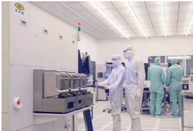
Cleanroom at EVG headquarters