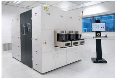
EVG* HERCULES* NIL Automated SmartNIL* UV Nanoimprint Lithography System up to 200 mm