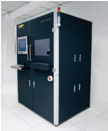
EVG*7200 Automated UV-NIL System up to 200 mm