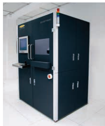
EVG*7200 Automated UV-NIL System up to 200 mm