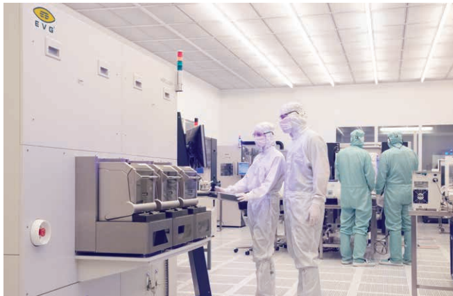
Cleanroom at EVG headquarters

As a result, EVG is able to provide consultation and support during process development and ramp-up to pilot manufacturing.